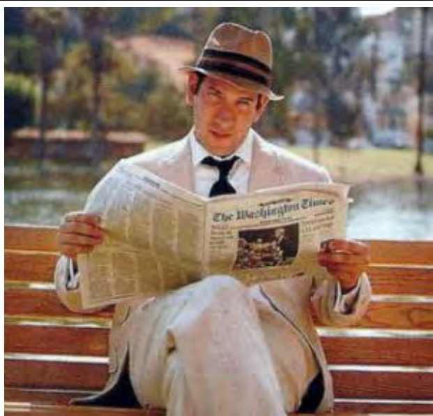
Matt Drudge with a copy of the National Weekly Edition of The Washington Times

There is no way the outside world can understand the massive and growing populist appeal of Donald Trump without understanding the uniqueness of this constellation of underfunded but spirited news platforms.