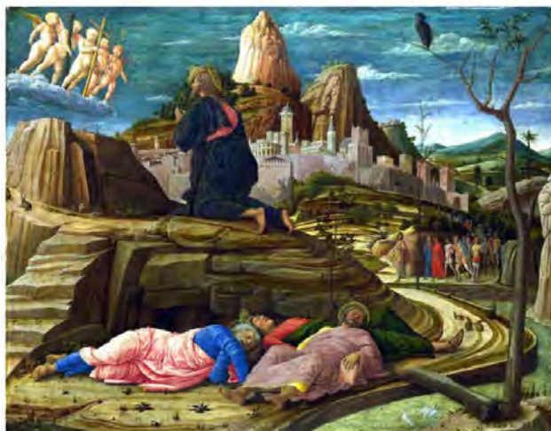
In Agony in the Garden, Jesus prays in the garden after the Last Supper while the disciples sleep and Judas leads the mob.

In other words, did the Messiah's death and resurrection matter more than his earthly ministry and physical life?