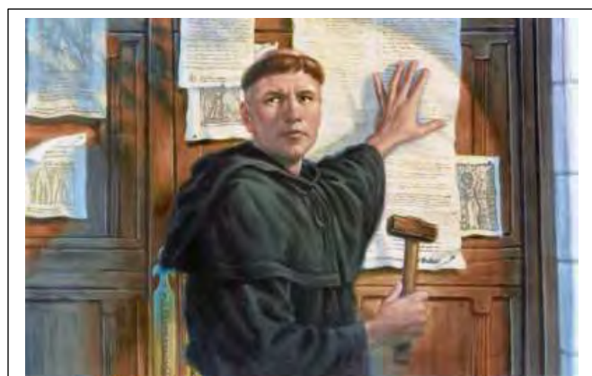
A depiction of Martin Luther posting The 95 Theses

The Apostle Paul's words on faith over deeds in Romans 1:17 decisively inspired Luther, the most influential religious figure of the late Middle Ages, as he himself testified at one of his legendary table talks.