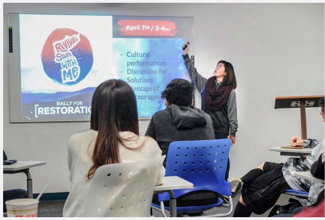
CARP chapters presented the vision and mission of the rally in their club meetings.

Like the last rally, we had two fronts of outreach. We invited our friends and chapters from our college campuses, and we asked our friends from ACLC and their church contacts to come out too.