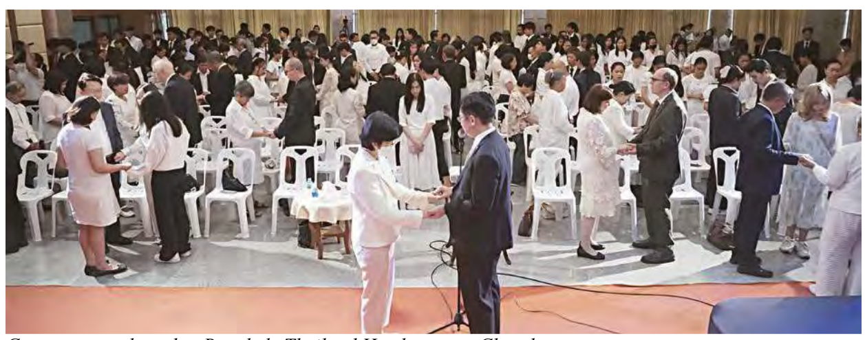
Ceremony conducted at Bangkok, Thailand Headquarters Church