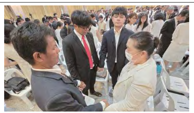
Bangkok, Thailand Headquarters Church

A special grace Holy Wine ceremony for entering the Cheon II Sanctum of Cheon Won Gung was held on February 23 at the Bangkok headquarters church in Thailand. About 300 people participated in the ceremony, including parents, children, and single-family members, following 21 days of Hoon Dok Hae readings and Cheon Shim Won devotions.