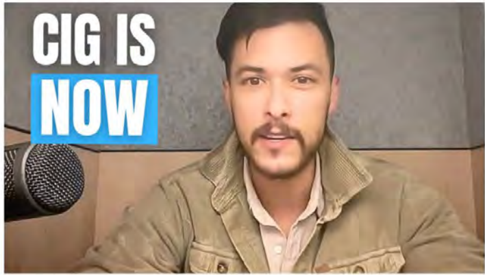
CIG is Now – Not Someday [Ep. 107] Dec 13, 2024