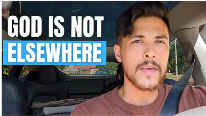
God is Here With You (Not Somewhere Else) [Ep. 108] Dec 26, 2024