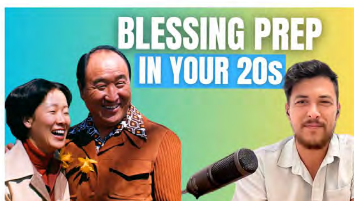
Blessing Prep in Your 20s (Faith, Finance, Health, Career) [Ep. 113] Feb 28, 2025