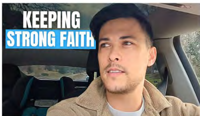
Keeping Strong Faith in Times of Doubt [Ep. 115] Mar 28, 2025