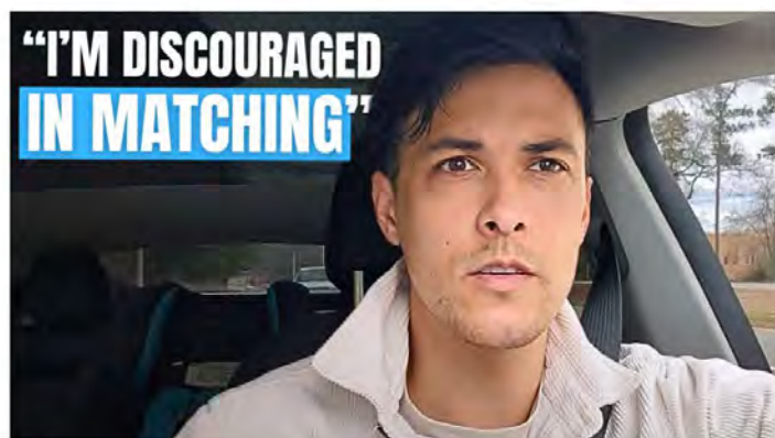
Discouraged in the Matching Process? [Ep. 114] Mar 14, 2025