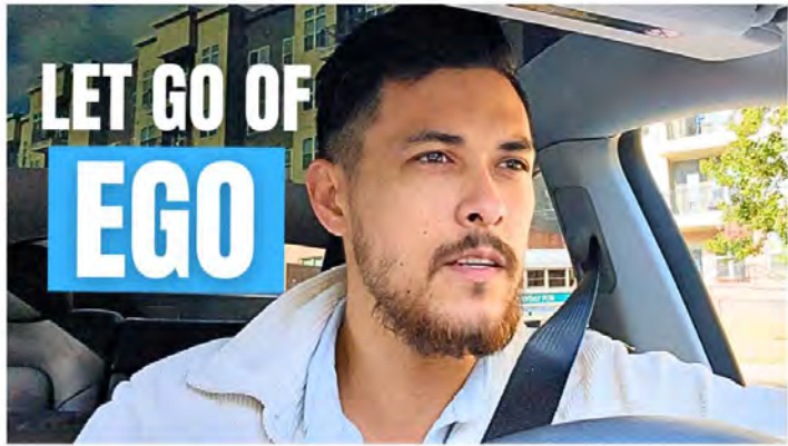
How to Let Go of Your Ego [Ep. 106] Nov 29, 2024