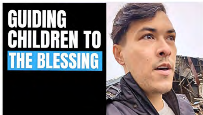
Guiding Adult Children to Receive The Blessing [Ep. 116] Apr 3, 2025