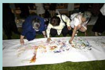
Women Coloring together

Others transferred the image onto large blank wallpaper, and it was rolled up and carried to Israel. During the week-long gathering of women, participants used paint and brushes to color in the mural. (see below)