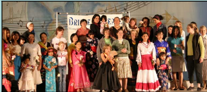
Some of the participants in the 2006 Bridge of Peace at the UNA Festival. Theme: Mothers and Daughters

In November 2006, Gwenn was awarded a citation which read in part: “A Salute to Gwenn Bair by the Columbus Chapter of the United Nations Association ... for bringing together peoples of different culture, color or creed in the Bridge of Peace Ceremony at the Columbus International Festival thereby promoting PEACE THROUGH UNDERSTANDING.”