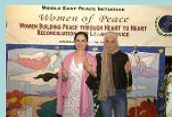
Finished Mural at Ceremony

Read more about this exciting Women of Peace event on the WFWP, USA website at: http://www.wfwp.us/wmepi.html