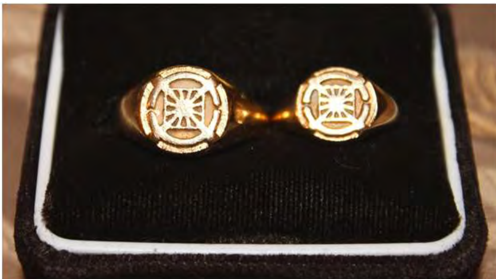
Unification church Holy Wedding We rings – His and Hers