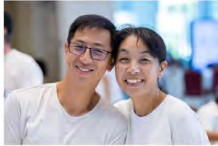
Strengthen Your Spiritual Life