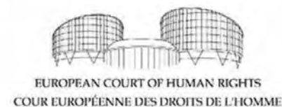
A logo of the European Court of Human Rights (ECHR). Photo: ECHR. Public domain image. Cropped

In a similar case, the European Court of Human Rights (ECHR) addressed accusations from the Russian government against the Jehovah's Witnesses, claiming the group's practices led to family break-ups . The ECHR's 2010 decision in "Jehovah's Witnesses of Moscow v. Russia" ruled against this notion , noting that personal dedication to religious beliefs, if freely chosen, cannot be blamed for family conflict . The court stated,