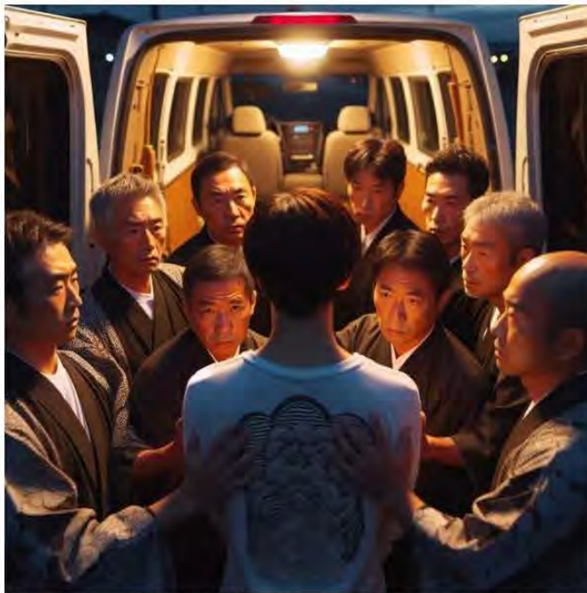
Young believer being abducted in order to have his faith broken.

The rally also included a panel display highlighting cases where believers had been confined by members of their own family and others opposing the religious organization, in attempts to force the believers to renounce their faith.