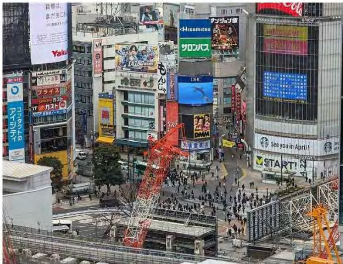
The area around Shibuya station, Tokyo. Photo (February 2024): Syced / Wikimedia Commons. Public domain image. Cropped

by the editorial department of Sekai Nippo