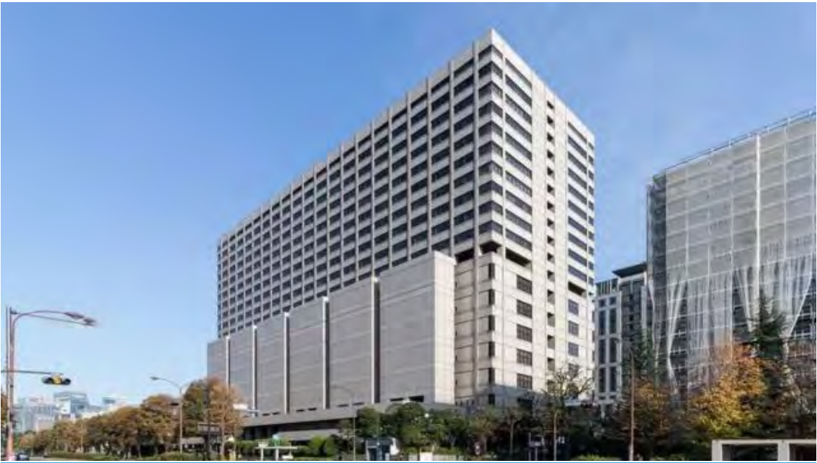
Tokyo District Court.

The dissolution of the Unification Church damages all religions, Japan, and its international image. All friends of religious liberty should protest a scandalous verdict.