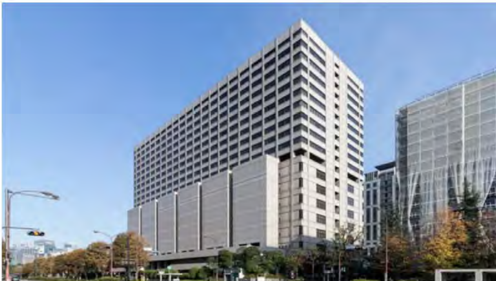
Tokyo District Court.

In Japan, Tokyo District Court granted on March 25 the request of the government to dissolve the Family Federation for World Peace and Unification (formerly known as the Unification Church) as a religious corporation. The Church has announced its intention to appeal.