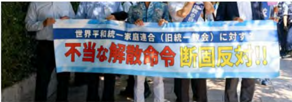
Unification Church believers and supporters march to protest the dissolution action.

There are other losers, however. As a leading Japanese Buddhist monk explained in an interview , all religions are among the losers as they are now at risk in Japan, including Buddhist temples. For decades, Japanese legislation on religious corporation has been interpreted by regarding only criminal decisions as grounds for dissolution of a religious corporation. Even then Prime Minister Kishida at first answered those claiming that the Unification Church should be dissolved that this was not possible, as the Church had not been found guilty in a single criminal case. Under media pressure, in turn fueled by militant anti-cult opponents of the Church, he quickly reversed his position and stated that having lost civil, as opposed to criminal, cases is enough to be dissolved.