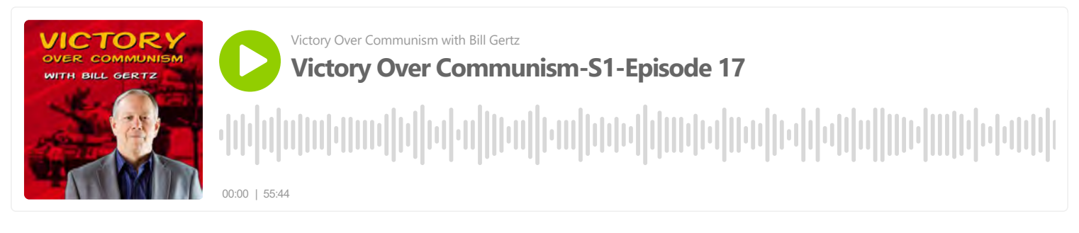
Jan. 27, 2023

China's Communist Party excels at using lies and deception in advancing the cause of Marxism-Leninism with Chinese characteristics. This episode delves into how the CCP obscured its spy balloon mission over the United States through the use of lies and deception. The counterproposal continues exploring a unique God-centered solution to the problems communism will never solve. The news portion looks at how China's communist system is fragile and facing mounting opposition from the Chinese people, the majority of whom despise the corrupt CCP. The interview is with Miles Yu, former State Department policy planning official on China and the foremost American expert on Chinese communist ideology.