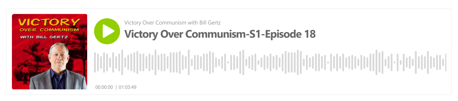
February 17, 2023

Riots during the summer of 2020 saw radical leftists tearing down statues of American leaders and later produced alarming imposition of Marxist woke policies throughout the country. These actions were not a spontaneous outpouring against injustice. They were the direct result of a carefully-cultivated Marxist strategy of rage to overturn the democratic system and impose a communist system in its place. The counterproposal section continues highlighting facts and truth behind the problems plaguing society today. They do not emanate from an economic system. World problems are rooted much deeper in spiritual shortcomings. The episode's news section looks at woke ideology and efforts by some Republicans in Congress to halt the imposition of radical policies and programs. The interview portion features New Left radical-turned freedom fighter David Horowitz.