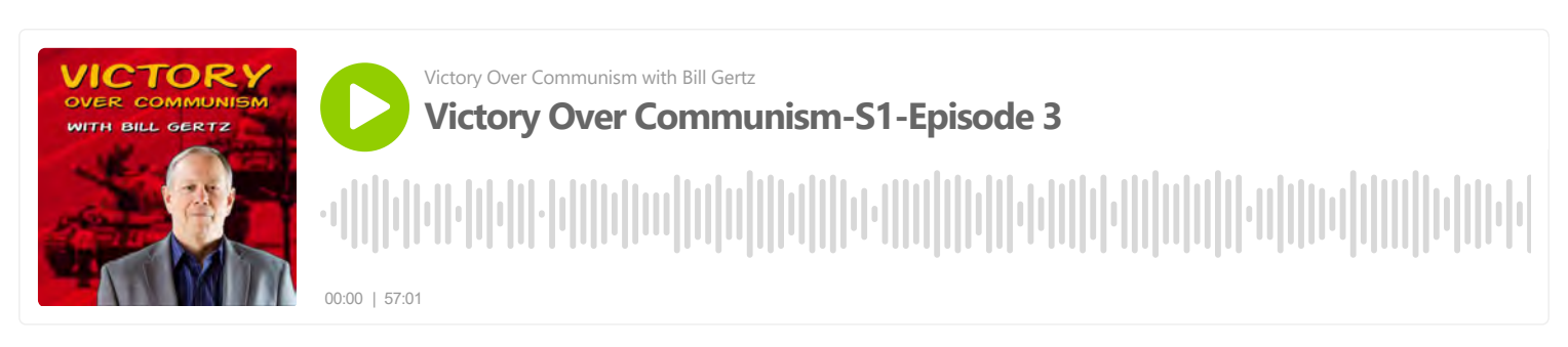
May 16, 2022

This episode examines Chinese high-technology repression through mass surveillance and social credit scoring. The podcast is in four parts about 15 minutes each. The first section drills down on how China is developing a totalitarian control system for use within China that eventually will be exported as part of the Chinese Communist Party's plan to achieve global supremacy and replace the free and open U.S.-led international system. Part 2 is the counterproposal section that looks at the United States' key role as the leading Judeo-Christian power that must assume responsibility for preventing a global communist takeover. The news section is my discussion of Secretary of State Antony Blinken's recent speech announcing the Biden administration's new policy toward China which is flawed by Blinken's announcement that the United States would not seek to replace the communist system. The interview section replays a portion of a key speech on Chinese communist ideology by Robert C. O'Brien, who was White House national security adviser in the Trump administration.