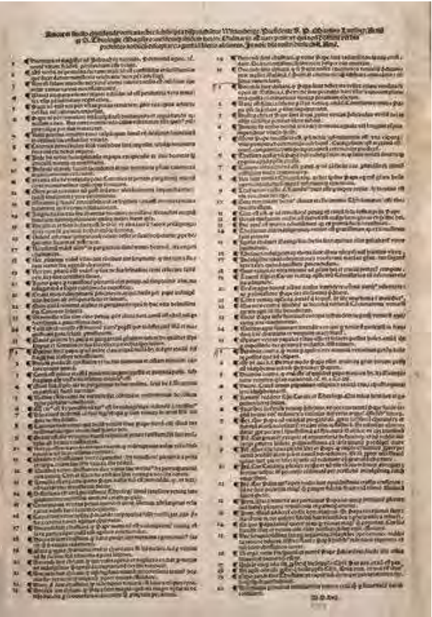
Martin Luther and the 95 Theses