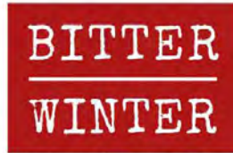
The logo of Bitter Winter

" Bitter Winter , the magazine dedicated to religious freedom and human rights, is a successful original enterprise that combines media people, activists, and scholars who are deeply committed to defend freedom of religion or belief (FoRB) for everyone, everywhere, always, and to denounce the persecution of believers.