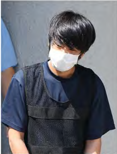
Tetsuya Yamagami, the man who killed Shinzo Abe, the former prime minister of Japan.

to the point of requesting its dissolution as a religious organization.