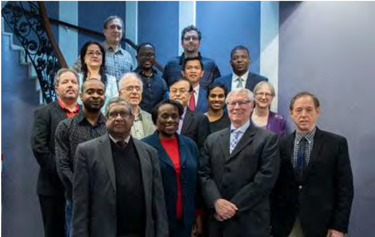
UTS Faculty and Staff at 4 West 43rd Street. The official new main campus for UTS as of July 1st.

The news came that the NY Board of Regents had approved the change of the main campus for UTS from Barrytown, NY to New York City. From July 1, 2019 the new name of the UTS main location will be the UTS New York City Campus located at 4 West 43rd St. Barrytown will be an "instructional site".