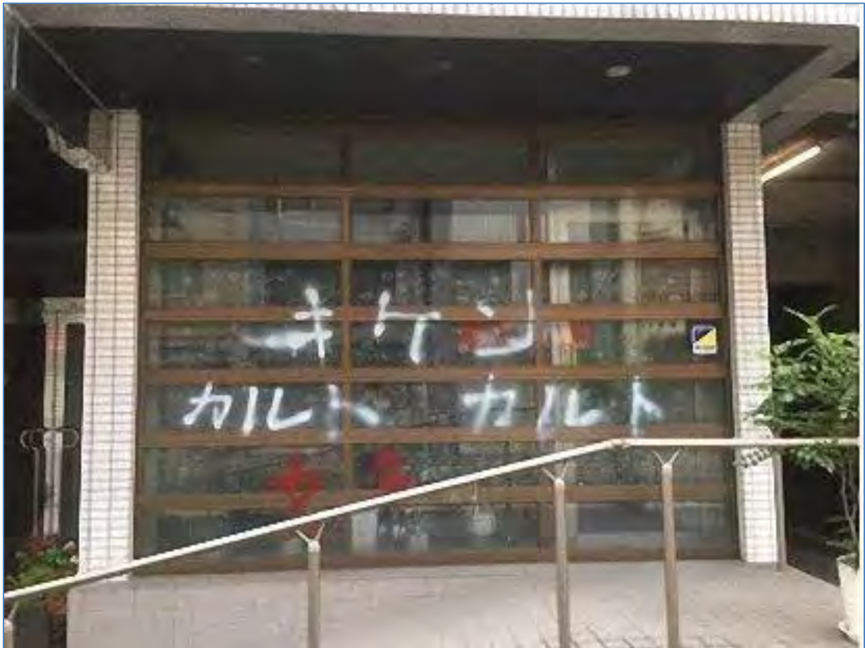
Hate Graffiti sprayed on Family Federation property in Japan in 2022 as part of vicious persecution

Investigative reporter shows what now happens in Japan - vicious persecution of the Family Federation - "is an attack on all religious freedom" and could happen to other faiths anywhere