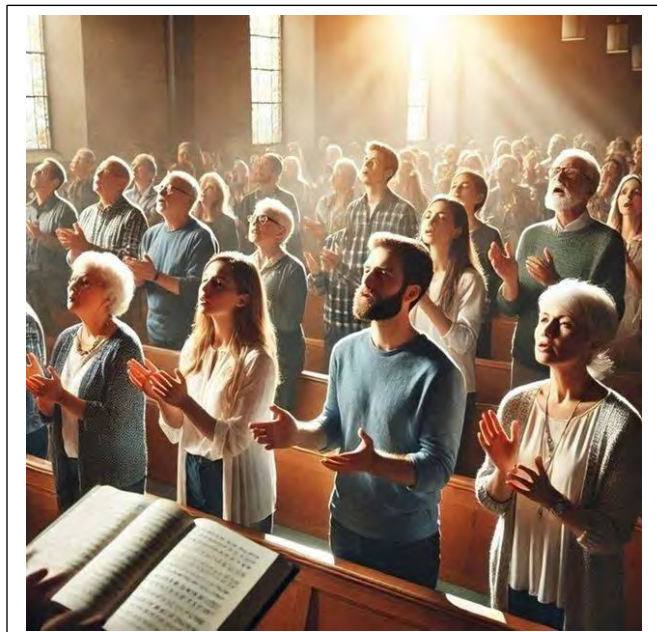
Congregation singing at the Sunday service

Because life in the Kingdom of Heaven is not a solitary life, is it? It's life as one family. So, either we're all part of it, or it's not life in the Kingdom .