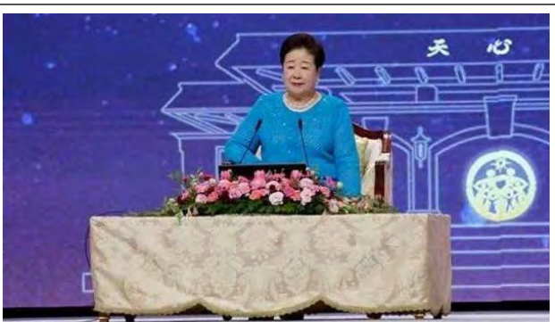
Mother Moon speaking January 1, 2025 in Gapyeong , South Korea

let me just say again to everyone, thank you for all of your efforts, exertions, devotions, everything that we did together in 2024.