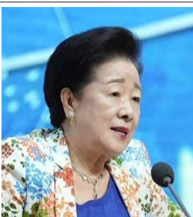
Mother Moon speaking in South Korea

[...] I think it's really important to take some time to digest and think about what True Mother shared with us last night. For myself, I always think about this word "substantially".