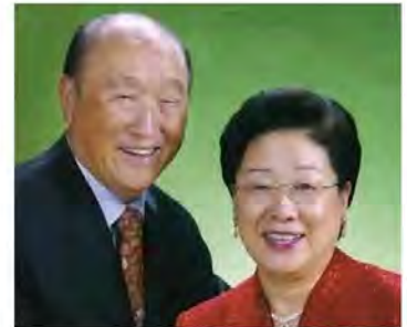
Father and Mother Moon

The significance of this special term is that God has finally been able to have a son and a daughter who have become the True Parents of humankind. Jesus only became the spiritual father of those who believe in him, because he never could hold the "Marriage of the Lamb". In other words, God had to wait for thousands of years before this ideal that True Parents represent could be realized. True Parents represent the very source of true love , true life, and a true lineage. It is only through True Parents that humanity may return to God and become true sons and daughters.