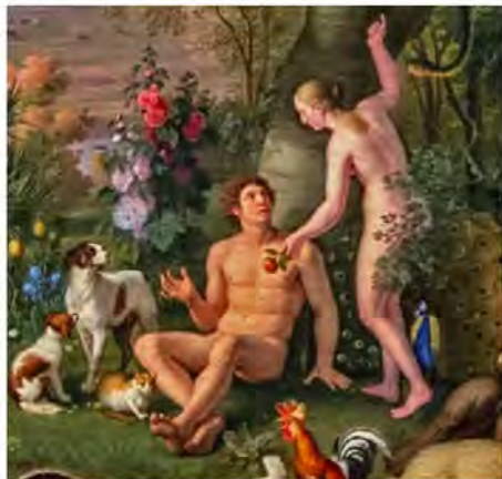
Adam and Eve in Paradise. Public domain image. Cropped

Because of the fall, we humans lost our originally intended position as true sons and daughters of God , who would have given them the stewardship of earth and heaven. Instead, the first humans fell to an incredibly low level when they were led astray by the archangel Lucifer and came under his dominion. Angels were created to be servants of God and human beings. We humans were created to be children of God . Instead, the first man and woman followed a rebellious angel and thus became the servants of a servant.