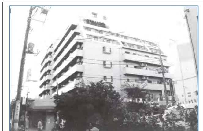
An apartment block in Ogikubo, Tokyo where Hirohisa Koide was forcibly detained in 1992

"I can't let go of anti- Unification Church books to avoid being drawn back into the organization ."