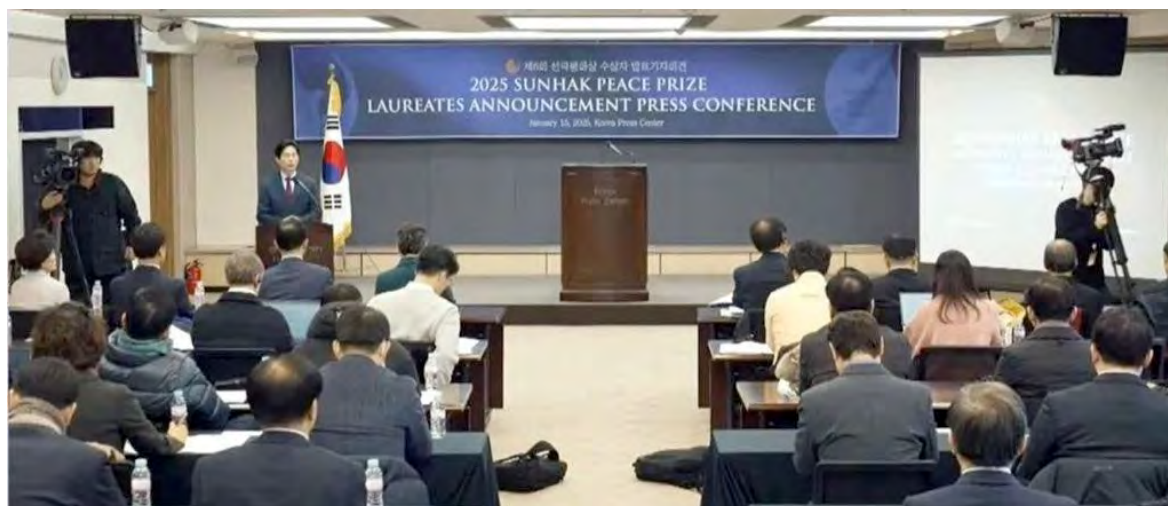
From the press conference 15th Jan. 2025 at Korea Press Center, Seoul, where the 2025 Sunhak Peace Prize Laureates were announced