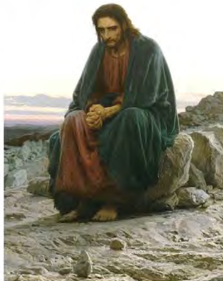
"Christ in the Wilderness", by Ivan Kramskoi (1837-1887). Painting in the Tretyakov Gallery in Moscow.

The famous painting "Christ in the Wilderness", by the Russian artist Ivan Kramskoi, is one of the pictures I feel represents Jesus. This is when he was in the desert fasting and praying for 40 days in order to make a new foundation . You can sense the sadness in his heart.