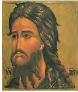
John the Baptist, 16th Century Russian icon painting in the Russian Museum. Public domain image. Cropped

It's important that we understand that the True Parents and Jesus were doing so many things to reach out. But important people like John the Baptist did not recognize their responsibility , and therefore Jesus was rejected.