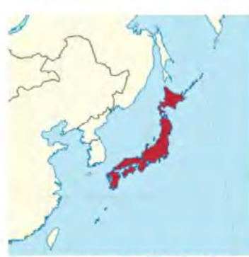
Japan. License: CC ASA 3.0 Unp. Cropped

In Japan, thousands of converts to the Unification Church and about 200 to the movement of Jehovah's Witnesses have during four decades been victims of abduction and attempts of forced deconversion in long-term confinement conditions: weeks, months and sometimes years. The Japanese media outlets always kept silent about these massive violations of human rights but were very prolific in their politically motivated campaigns stigmatizing the Unification Church as a