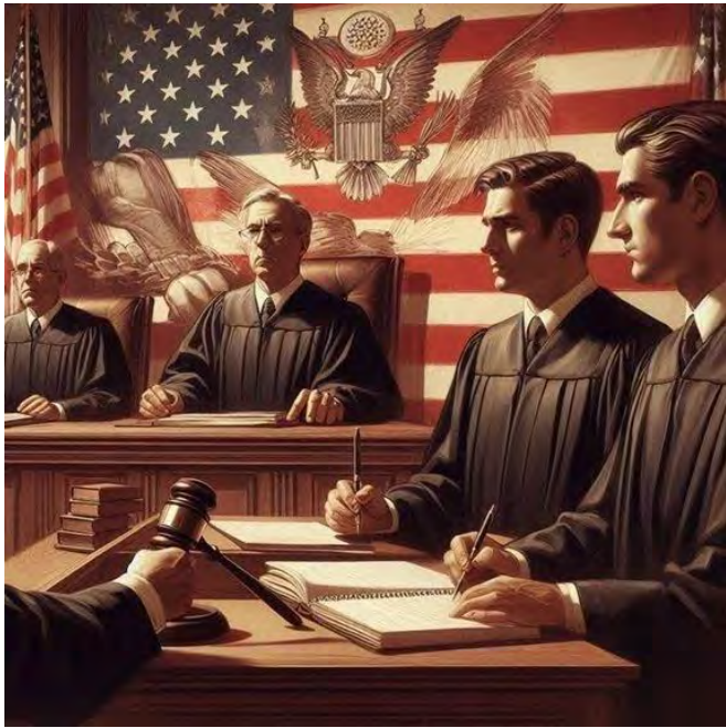
How will the DC Court of Appeals rule?

The outcome of this case could shape how courts handle financial disputes within religious organizations. The plaintiffs urge the appellate court to reject the trial court's stance, arguing that religious entities should not be immune from legal oversight when fraud and financial misappropriation are at issue.