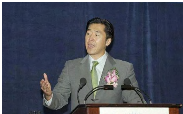
Hyun Jin Preston Moon speaking in 2007