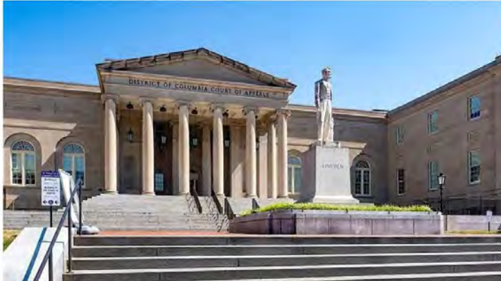
District of Columbia Court of Appeals.

NEW YORK, Sept. 5, 2024 /PRNewswire/ — The Family Federation for World Peace and Unification International (FFWPUI) continues to seek justice in the United States against Hyun Jin “Preston” Moon and his codefendants for allegedly misappropriating $3 billion worth of Church assets. In a new Court filing with the District of Columbia Court of Appeals, FFWPUI argues that U.S. Courts absolutely have jurisdiction to try the case, where an individual fraudulently conveyed Church assets for his personal enrichment.