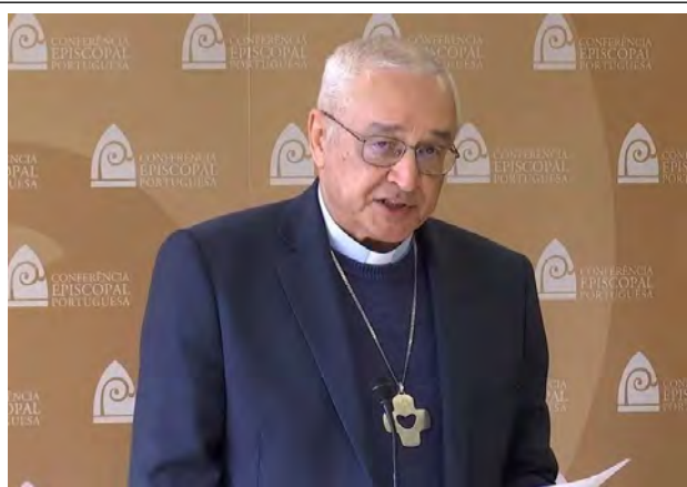
The Catholic Church in trouble over thousands of sexual abuse cases. Here, the President of the Portuguese Episcopal Conference, José Ornelas (Bishop of Leiria-Fátima), makes an address following the presentation of the report of the Independent Commission for the Study of Child Sexual Abuse in the Portuguese Catholic Church, on 13 February 2023

The court failed to determine whether an exception to ecclesial abstention exists in cases of fraud, corruption, or collusion. By refusing to address this issue, the trial court effectively "handed defendants absolute immunity for misconduct for which everyone else in civil society must be accountable."