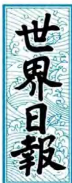
Logo of the Sekai Nippo

Token compensation for member of persecuted minority the Family Federation in legal victory in defamation case against activist journalist