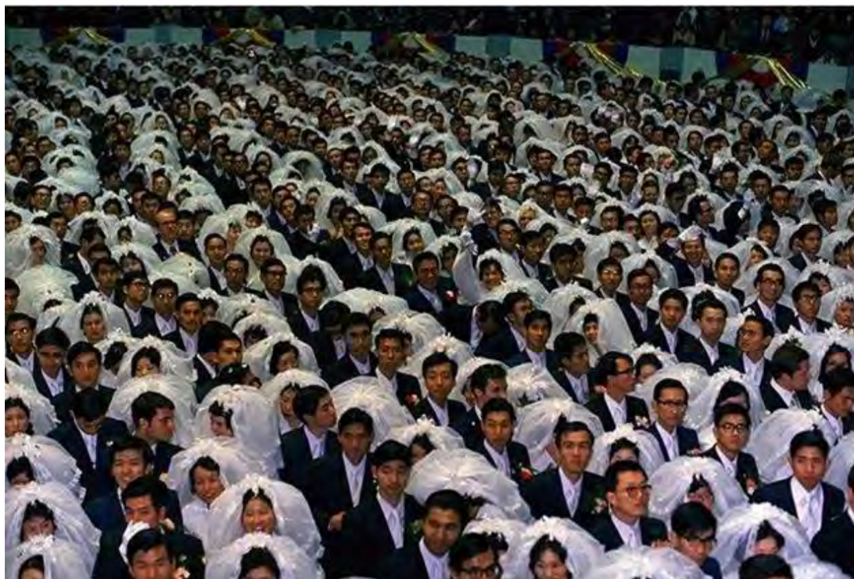
From the Marriage Blessing ceremony of the 1800 couples on February 8, 1975

The South Korean Minister of the Board of National Unification gave a congratulatory speech. More than 10,000 guests could watch the event. Straight afterwards, the couples boarded 94 sightseeing buses for a parade through the downtown streets of Seoul.