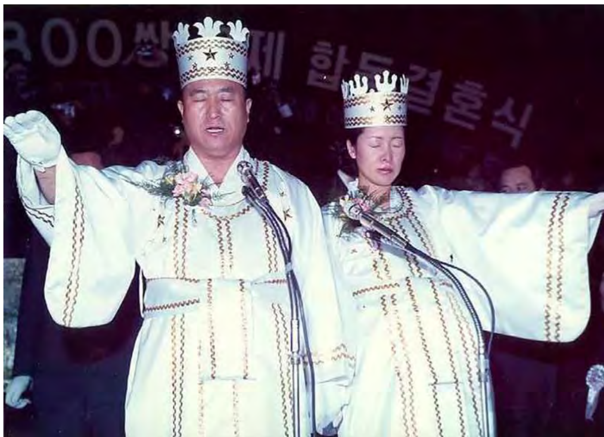
Father Moon and Mother Han praying for all the couples at the Marriage Blessing ceremony of the 1800 couples on February 8, 1975

This event remains a landmark in the history of the Family Federation , symbolizing its vision of spiritual and social transformation through family values .