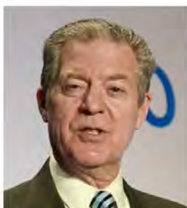
IRF Summit co-chair: Sam Brownback , US ambassador-at-large for

First of all, I want to extend my greetings to Ambassador Sam Brownback, US