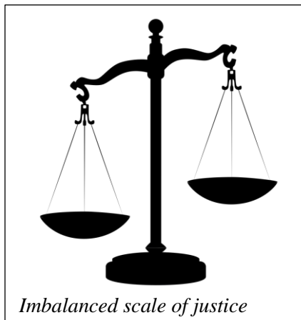
Imbalanced scale of justice

This was entirely predictable from the beginning.