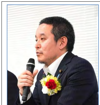
Senator Satoshi Hamada, House of Councillors, NHK Party) speaking on 26th January 2025, in Yokohama City, Kanagawa Prefecture, Japan

Question: Senator Satoshi Hamada (浜田聡) submitted a written inquiry to MEXT requesting fact-checking regarding this newspaper's report, but MEXT did not respond. What do you think about the fact that the proceedings are being conducted in a closed, non-public manner?