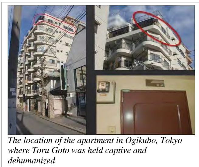
The location of the apartment in Ogikubo, Tokyo where Toru Goto was held captive and dehumanized

Freedom of the mind - if we refer to the Japanese Constitution, it is Article 19 [Editor's note: Freedom of thought and conscience] and Article 20 [Editor's note: Freedom of religion]. Looking at this on a global scale, the freedom of religion is an absolute, inviolable human right. This is firmly established under the Universal Declaration of Human Rights.