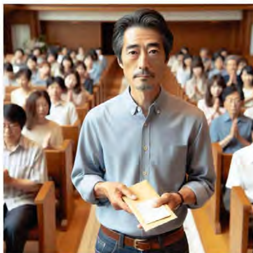
Japanese man offering a donation to support missionary work.