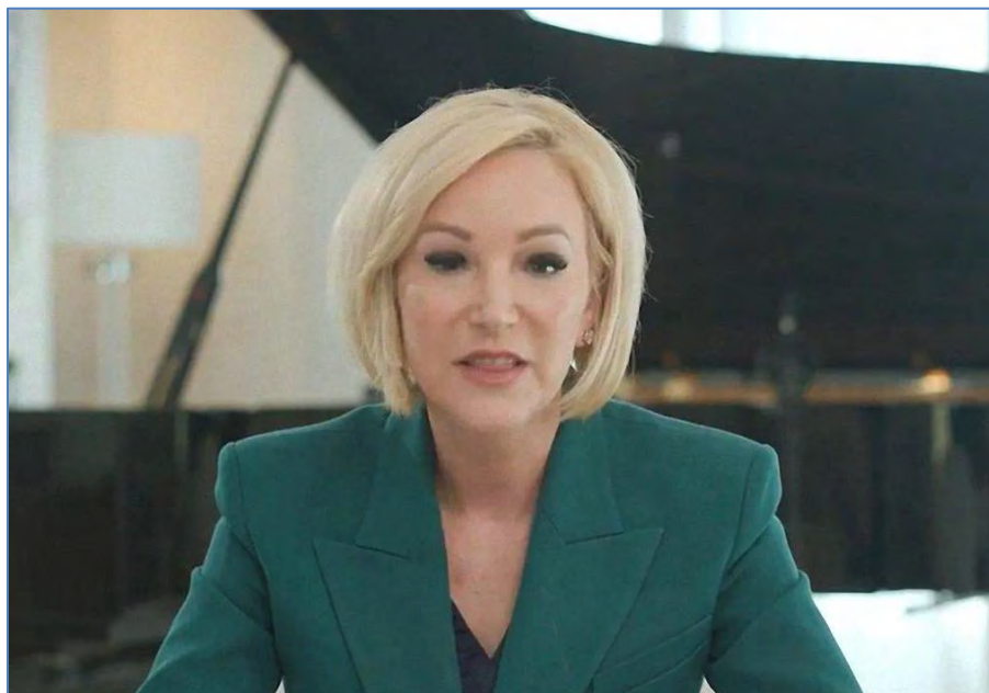
Paula White in a video message December 8, 2024 to a conference in Tokyo organized by Japanese Committee of the International Coalition for Religious Freedom (ICRF)