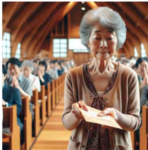
Disputed donations. Here, woman offering donation that her son later wanted refunded.