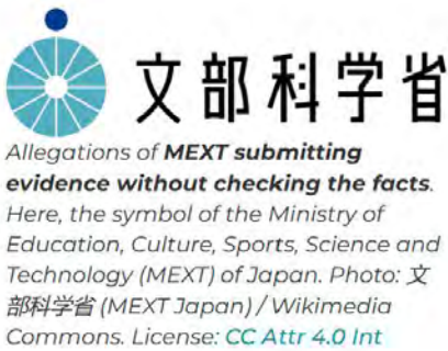
Allegations of MEXT submitting evidence without checking the facts. Here, the symbol of the Ministry of Education, Culture, Sports, Science and Technology (MEXT) of Japan.

The Ministry of Education, Culture, Sports, Science and Technology (MEXT) submitted a written statement as evidence in its request to the Tokyo District Court for the dissolution of the Family Federation for World Peace and Unification (formerly the Unification Church ). However, our newspaper received information from the person who allegedly signed the document, stating, “I did not write this,” and “It is not true.” We conducted a direct interview with the named individual.