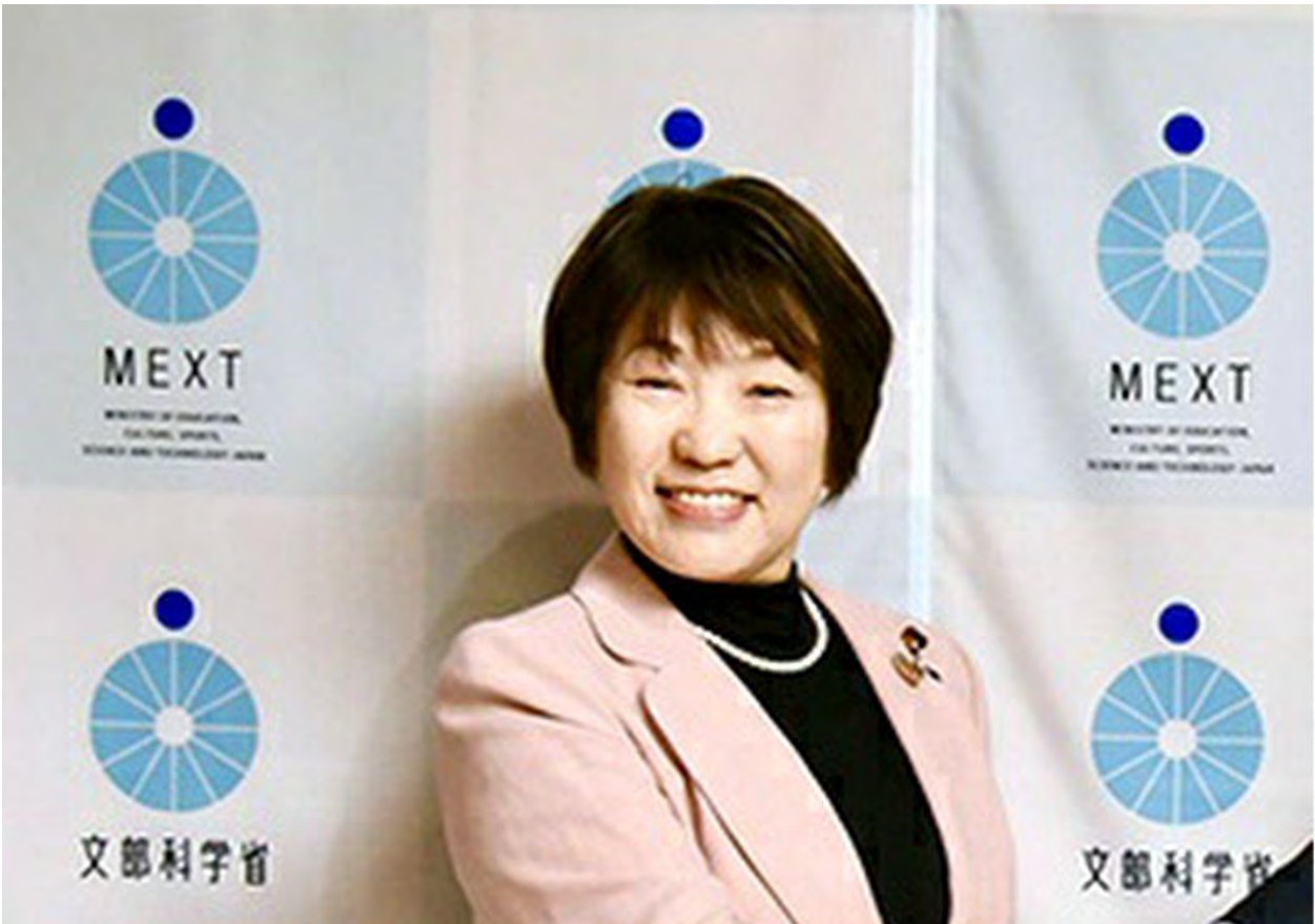
Minister of Education, Culture, Sports, Science and Technology Toshiko Abe Feb. 17, 2025