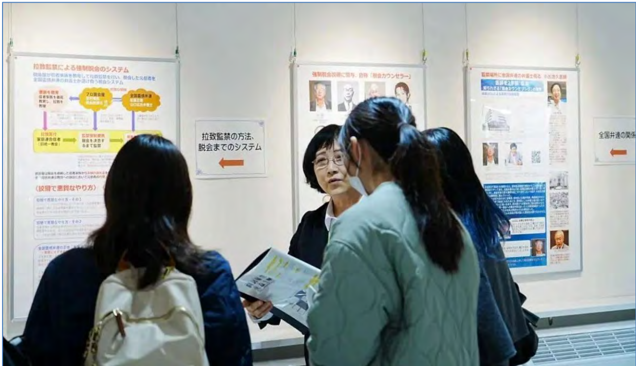
A panel exhibition raising awareness about abduction and confinement victims - March 19, 2025, Yokohama, Kanagawa Prefecture, Japan