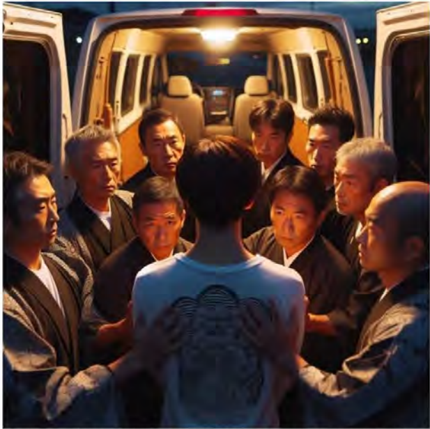
Young believer being abducted in order to have his faith broken.