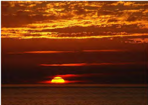
Is Japan becoming the land of the setting sun? Here, a sunset at Porto Covo, west coast of Portugal. Photo: Alvesgaspar / Wikimedia Commons . License: CC ASA 3.0 Unp

by the editorial department of Sekai Nippo