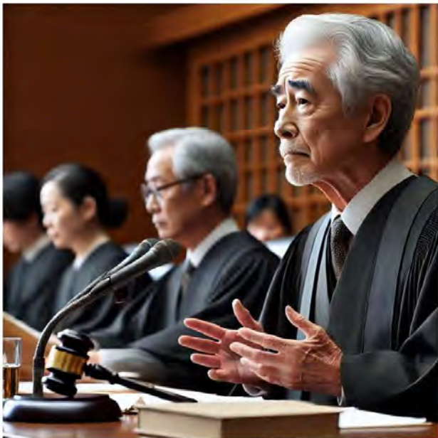
Japanese judges using "reasonable inference" in order to dissolve religious minority organization even though there was no evidence for it. Illustration. Microsoft Designer Image Creator, 6th January 2025.

"reasonable inference" [See editor's note below] despite the lack of evidence proving the "continuity" of unlawful acts. The court also remained silent on the violations of international human rights law, which I particularly emphasize. Even evidence provided by the defense – demonstrating that the religious organization refunded donations in good faith – was twisted by the court and used against the religious organization as proof of wrongdoing.