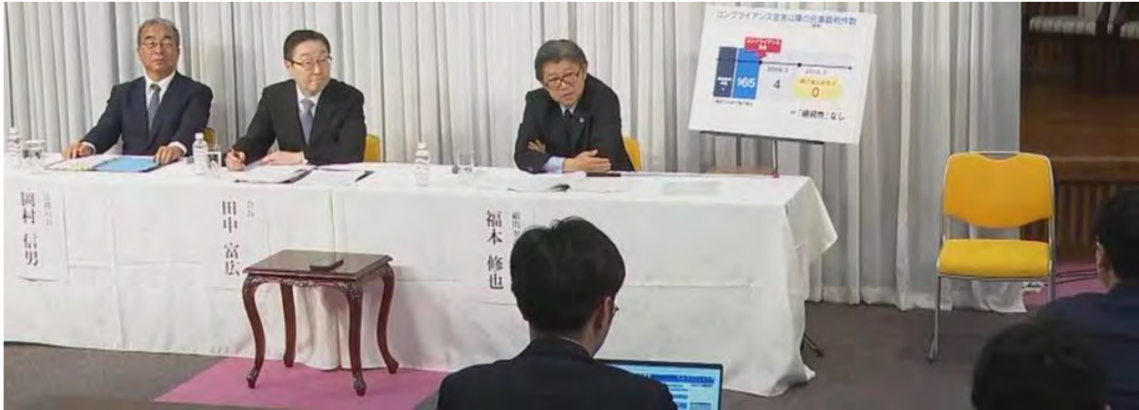
From the press conference March 25, 2025 in Shibuya, Tokyo

The court ruling also referenced past legal issues involving businesses run by church members, including "spiritual sales" (where religious beliefs were used to sell goods) and the "Shinsei Incident" (新生事件) [See editor's note 3 below] (involving arrests for violations of the Act on Specified Commercial Transactions). However, these matters had already been resolved through legal judgments, settlements, or criminal penalties. Since the Compliance Declaration [See editor's note 4 below], almost no new issues have arisen. Nevertheless, by retroactively expanding the scope of alleged "damages", the court inferred that past wrongdoing continued even after the reforms and ultimately justified dissolution.