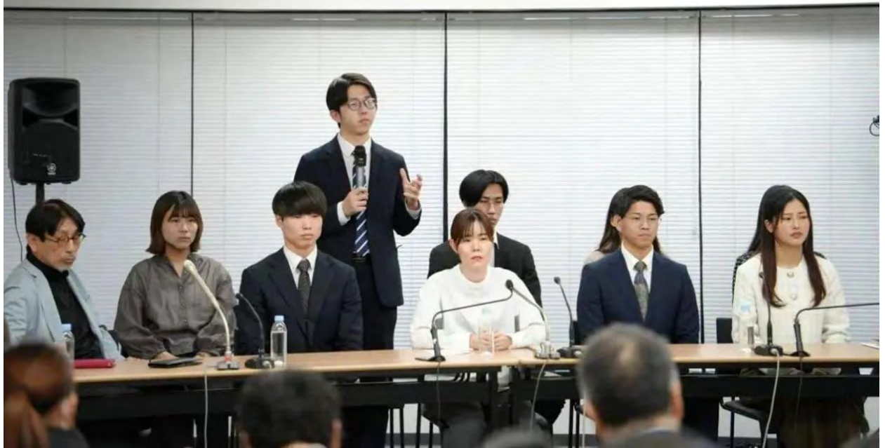
A second-generation believer answers a reporter's question - March 26, 2025, Shibuya Ward, Tokyo