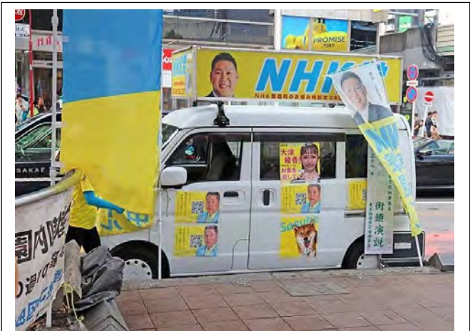
NHK party election car July 6, 2024

by the editorial department of Sekai Nippo