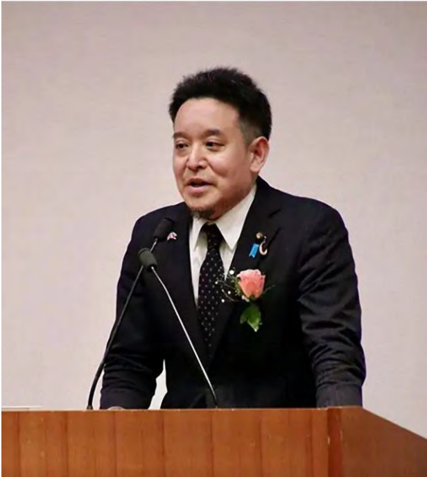
Senator Satoshi Hamada giving a speech at a gathering March 28, 2025, Niihama City, Ehime Prefecture, Japan