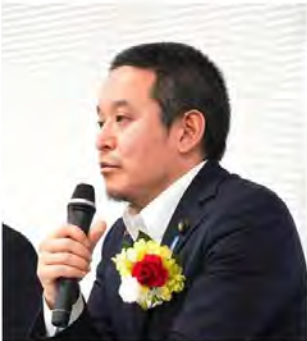
Senator Satoshi Hamada (浜田 聡, House of Councillors, NHK Party) here speaking in Yokohama City, Japan on 26 th January 2025.

"The crime of the century: MEXT filed a request for a dissolution order based on falsified statements . A designated agent of MEXT, who is a government official, falsified evidence to be used in court proceedings. If Japan grants the dissolution order based on fabricated evidence , it will become a disgrace to the world." – Attorney Shinichi Tokunaga (on X)