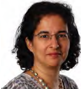
Sent formal UN request to Japan, but no reply: Nazila Ghanea, UN Rapporteur on Religious Freedom since February 2023.

By this act, the Japanese government has shamefully abandoned the core principles of human rights and religious liberty enshrined in the United Nations conventions that Japan itself has signed and committed to uphold. It now aligns itself with pariah states that routinely deny their citizens the