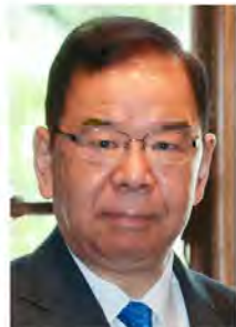
Declared the ‘final war’ against the Unification Church : Kazuo Shii, here 30th March 2023.

“This is the final war against the Unification Church .” – Kazuo Shii, Chairman, Japanese Communist Party.