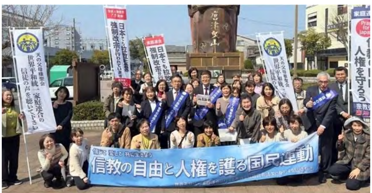
Demonstration against unjust and xenophobic <u>verdict</u> against the <u>Family Federation</u> in Japan. Here members in Karatsu City on the southern island of Kyushu protesting March 30, 2025

properties held by the <u>religious organization</u> and confiscate donations made by everyday members, raising deep concerns about the future of religious freedom in the country.