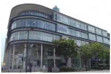
Shimonoseki Lifelong Learning Plaza. Photo: Zilog80 / Wikimedia Commons. License: CC ASA 3.0 Unp. Cropped

Church). This decision follows the Tokyo District Court 's issuance of a dissolution order for the religious organization on 25<sup>th</sup> March. Mayor Maeda stated, "We will comply with the judicial decision."