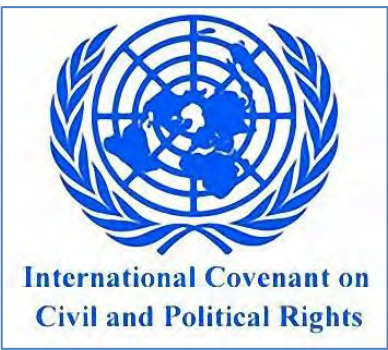
a violation of international law.