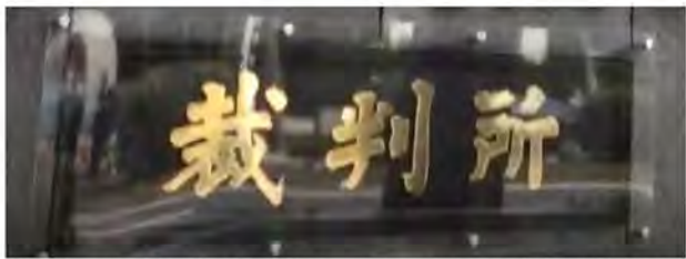
Courts used for lawfare? Here, sign outside Tokyo District Court.

aberration of justice is the difference between prosecution and persecution. These days it is called lawfare and has been pointedly prohibited by the UN International Covenant signed by Japan. To dissolve the church , domestic laws are being unilaterally reinterpreted and given precedence over a signed international treaty, thereby putting Japan in a precarious position where it betrays its international obligations. This exonerating evidence was entirely ignored in the Japanese court's judgment of March 25 .