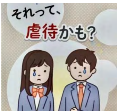
State-sponsored deprogramming: Here, from the cover of a pamphlet used in Japanese schools. It explains that they may be abused by being "forced to participate in religious activities" and "threatened by words like 'You will go to hell.'"

generation members - isolating children from their parents and discouraging them from continuing their parents' faith. Fukuda calls this "state-sponsored faith-breaking", a form of government-led brainwashing.