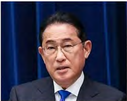
Made a 180-degree flip-flop, changing the law overnight: Former Prime Minister Fumio Kishida . Here, at press conference 14th August 2024.

It took a 180-degree flip-flop to reinterpret Japanese laws to use civil misdemeanors to dissolve the church. This turnaround happened at night behind closed doors, was conducted in less than 24 hours, never subjected to legislative or judicial review, and applied retroactively – all with the sole purpose of dissolving the Unification Church. This is unprecedented in Japan and other developed democracies.