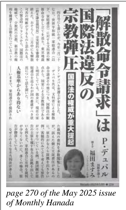
page 270 of the May 2025 issue of Monthly Hanada

Article 81, Paragraph 1 of Japan's Religious Corporations Act stipulates that a religious organization can be dissolved for acts that "violate laws and significantly harm public welfare." The Tokyo District Court determined that the Family Federation had caused "unprecedented harm" based on past civil lawsuits.