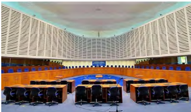
Courtroom of the European Court of Human Rights in Strasbourg (2014)

She further points out that the so-called "mind control theory" used to claim that followers were coerced into donating, lacks scientific basis and is rejected by international standards .