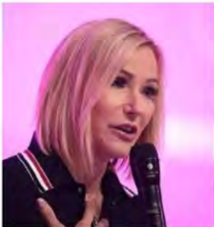
Rev. Paula White, here 11th June 2021 in Grapevine, Texas. License: CC ASA 2.0 Gen. Cropped