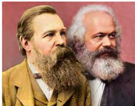
Karl Marx (right) and Fredrick Engels would have been proud of Japanese activist lawyers. Here, handcolored portraits of them, Marx from 1872, Engels 1877.

Left-wing lawyers are blinded by political revenge. Ostensibly, without any thought or consideration, they willingly dishonor Japan on the global stage. The lawyers' harm to "public welfare" (the legal term used to justify the dissolution order circumventing criminal conviction) is far worse than the church's misconduct of collecting large donations from faithful followers which is litigated in civil court, when needed. More importantly, the church has instituted successful, self-imposed reforms from within and not a single civil case has been filed in the last seven years.