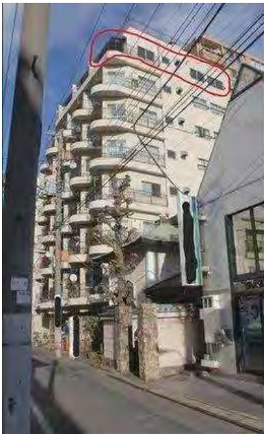
Property for confinement: The location of the 8th floor apartment in Ogikubo, Tokyo where Toru Goto was held captive and dehumanized

The book also refers to this process as "protection", but its true nature is clear: