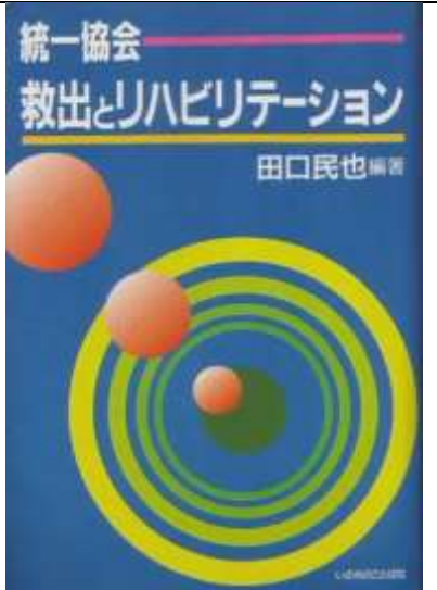
The front cover page of Tamiya Taguchi's book "Unification Church: Rescue and Rehabilitation"

Manual for dehumanizing abuse of one's own offspring readily available in Japanese bookstores with step-by-step guide to abduction, confinement and faith-breaking