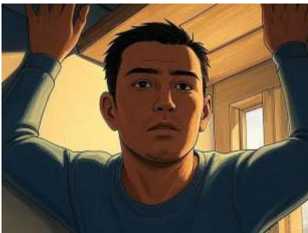
Removing ceiling panels in order to escape in May 2025

"First, nail the long wooden slats on both sides of the column. Try not to damage the apartment structure too much, but some damage is inevitable. If using acrylic sheets, line them up as needed and secure them with screws from behind. Use an electric drill to fix them in place."