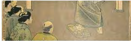
This print shows Fumi-e (踏み絵 fumi “stepping-on” + e “picture”); step on a picture with the likeness of e.g. the Cross of Jesus or the Virgin Mary. Cropped

identify hidden Christians (known as Kirishitan ) and their sympathizers during a time when Christianity was banned in Japan. While the act of stepping