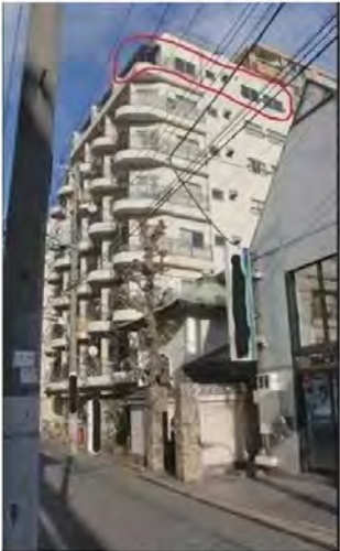
Property for confinement: The location of the 8th floor apartment in Ogikubo, Tokyo where Toru Goto was held captive and dehumanized.