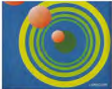
The front cover page of Tamiya Taguchi's book "Unification Church: Rescue and Rehabilitation"

Unification Church and Rehabilitation (統一教会、救出とハビリテーション). Taguchi was a well-known "deprogrammer" (faith-breaker) who specialized in persuading people under conditions of confinement. That year alone, 204 cases of abduction and confinement were reported. (Showing image) Here is the book, Unification Church: Rescue and Rehabilitation.