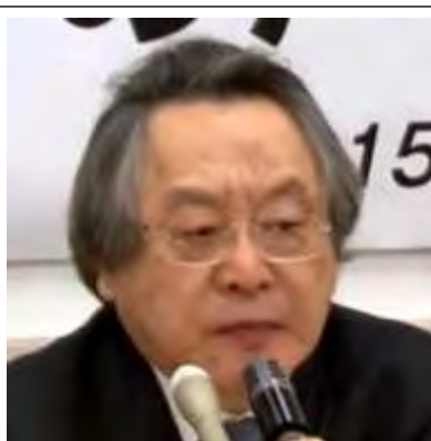
Setsu Kobayashi, author, constitutional scholar and professor emeritus at Keio University, Japan (2015)