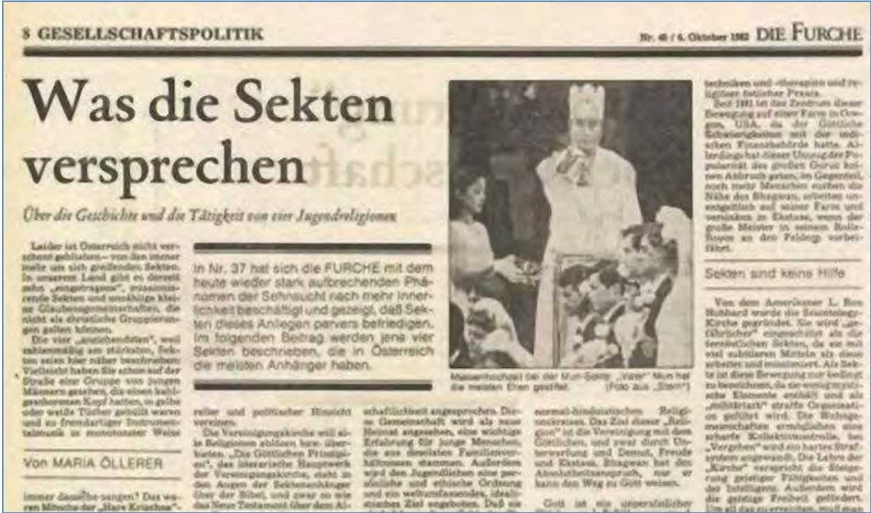
Copy of alarmist article (1982) using the word "Sekten" (cults) in an Austrian weekly

Media often remain silent on harmful impact of religious persecution and discriminate against unpopular groups by calling them "cults"