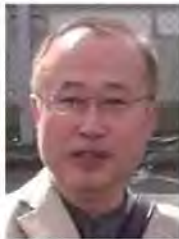
Yoshifu Arita in 2014. Photo: 碧庵 / Wikimedia Commons. License: CC ASA 3.0 Unp. Cropped