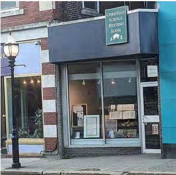
In France, considered a threat to public order: Christian Science. Here, one of their reading rooms, this one located downtown in Brattleboro, Vermont, USA.

Austria is not alone. In Germany, state and media actors have long labeled groups like Scientology and others as "anti-democratic" without judicial basis. These designations have led to surveillance, job loss, and social ostracism.