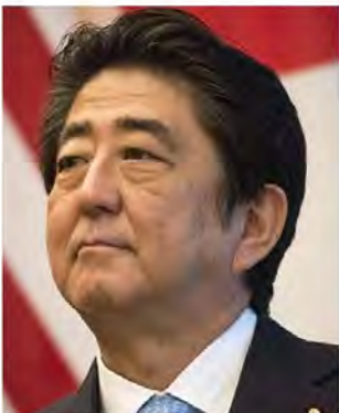
Shinzo Abe in 2017.

So, it is important to look at who was speaking the truth and who was spreading falsehoods about this issue and consider changing our sources of information. False information and unreliable sources have led to irreversible consequences. The tragedy that has already