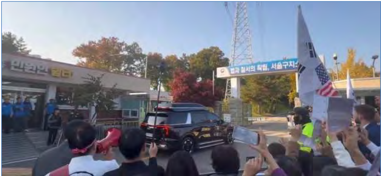
Mother Han returning (in the black car) to Seoul Detention Center on November 7, 2025

Seoul prosecutors show no health concerns: Court denies 82-year-old detainee's medical leave extension, orders return to tiny detention cell