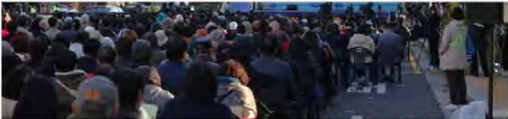
From a large demonstration rally in support of Mother Han near Seoul City Hall 2nd November 2025 organized by Incheon, Gyeonggi Northern Diocese of the Family Federation for World Peace and Unification . The rally had the theme “One Heart, One Peace Rally for Religious Freedom and Peace”. It was attended by about 2,000 persons.