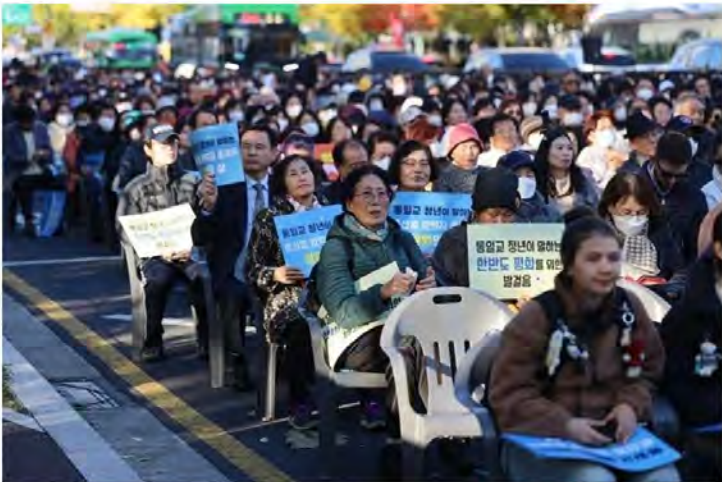
From a large demonstration rally in support of Mother Han near Seoul City Hall 2nd November 2025 organized by Incheon, Gyeonggi Northern Diocese of the Family Federation for World Peace and Unification. The rally had the theme “One Heart, One Peace Rally for Religious Freedom and Peace”. It was attended by about 2,000 persons.

In that sense, we should stand up and we should speak up. We should have our conviction. It starts with my conviction.