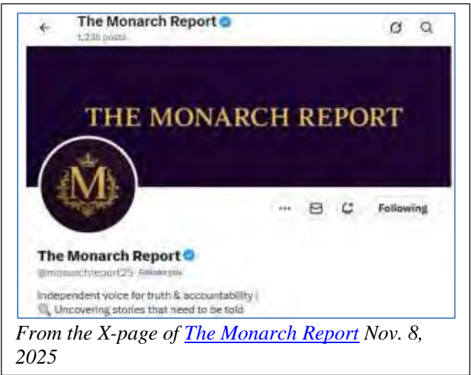
From the X-page of The Monarch Report Nov. 8, 2025

Detention centers, often overcrowded with limited medical oversight, are unfit for this delicate phase, potentially exacerbating her condition through restricted movement and exposure risks. Critics argue the prosecution and judiciary prioritize custody over humane health considerations, raising questions about pretrial practices in South Korea."