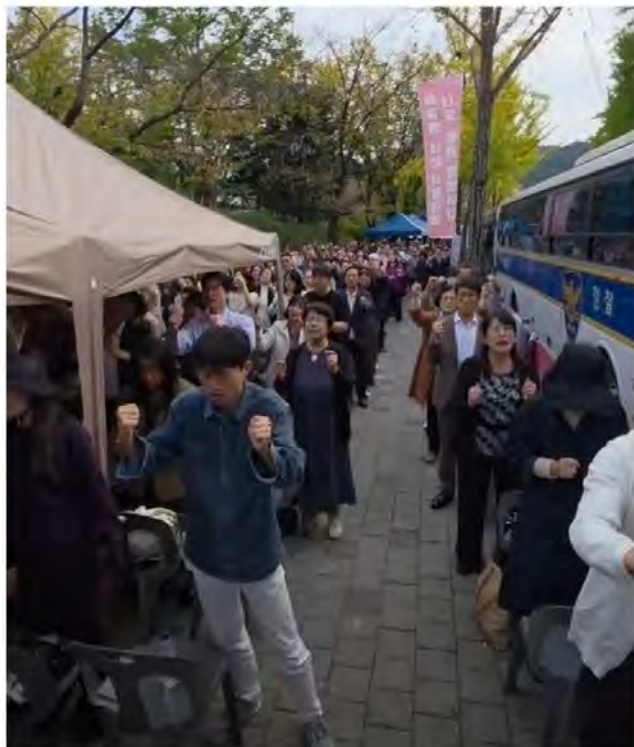
From a prayer vigil outside Seoul Detention Center 20th October 2025 for Mother Han to be released.

should be none of us that are satisfied until this problem is solved. Yes.