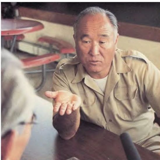
Sun Myung Moon during a special interview by a Japanese journalist in Danbury Federal Correctional Institution in 1985.

A significant portion of the Introduction is devoted to procedural context, particularly the Grand Jury system. Hirao describes how evidence was presented without defense participation and notes that early reviews by Department of Justice officials initially found insufficient grounds for indictment. Only after additional evidence was introduced did the prosecution proceed. Even then, he stresses that the final charges were not for tax evasion, highlighting what he sees as a critical misrepresentation perpetuated by media coverage.