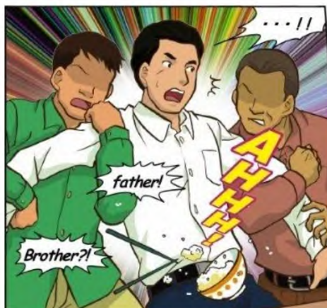
A son being forcibly abducted by his family and taken away, locked up in order to undergo dehumanizing faith-breaking.