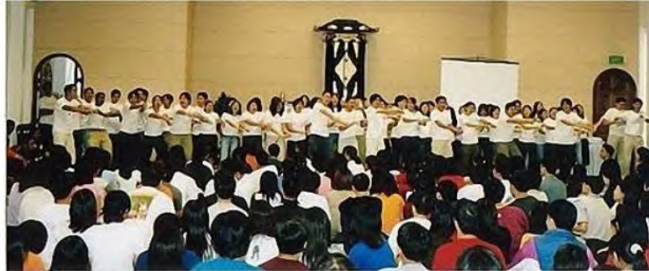
Also subject to faith-breaking attempts: Members of Soka Gakkai. Here students belonging to the faith in 2001.

However, also Soka Gakkai, a Buddhist-based lay