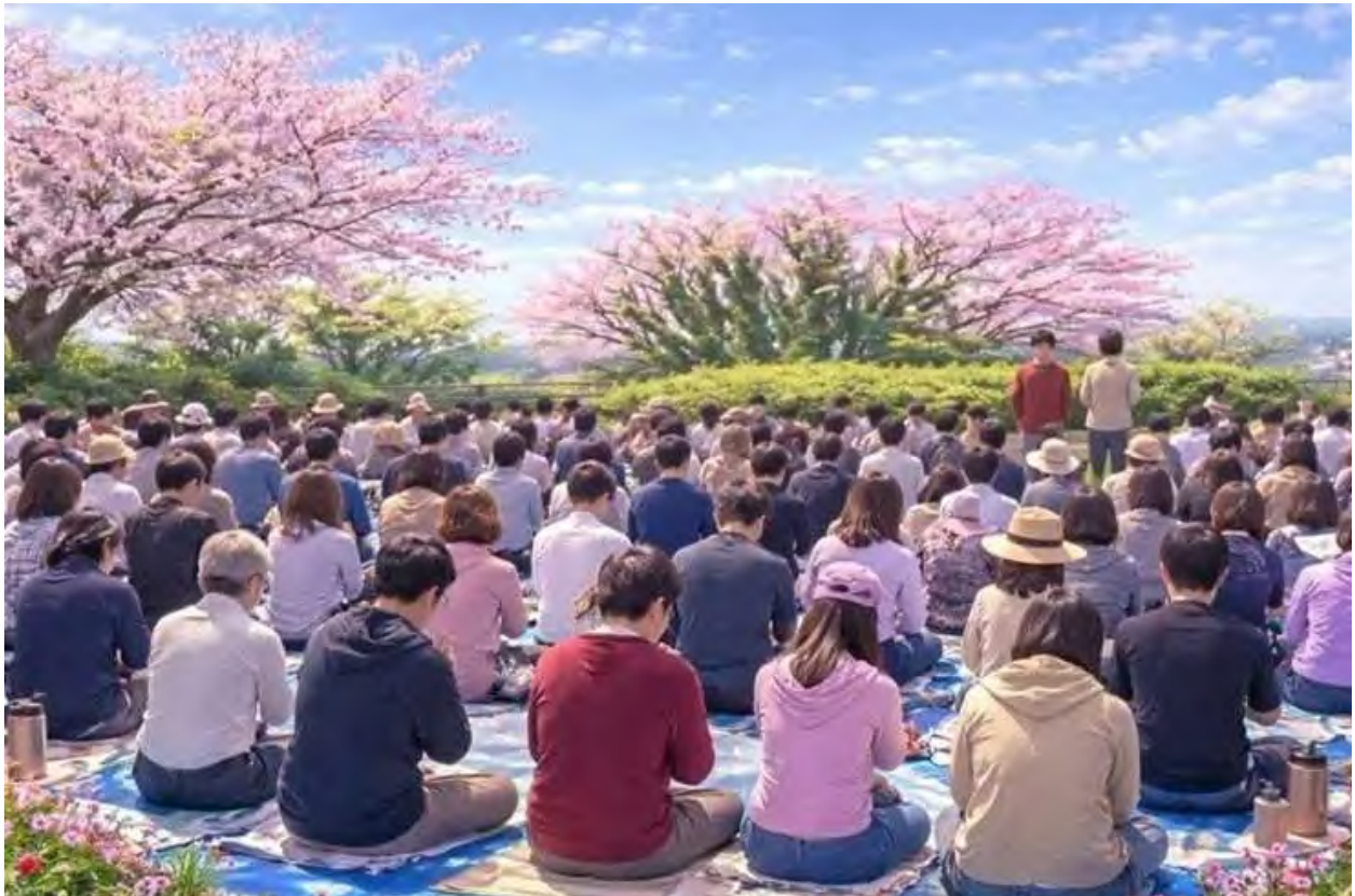
The state took their places of worship. Must hold worship services in parks. AI illustration of Family Federation members gathering in a Japanese park for their Sunday meeting April 5, 2026.

Another psychiatrist's report, titled "Considerations on the Current Situation and Issues Facing Believers Following the Dissolution of the Family Federation ", highlights two particularly common responses in the survey: "We no longer have a place to gather" and "We can no longer carry out the religious activities we used to."