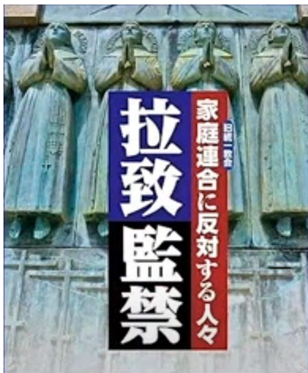
Front cover page of "Kidnapping and Confinement Carried out by Opponents of the Family Federation ", by the Family Federation , published in Japanese on Kogensha Sep. 2023, 241 pages