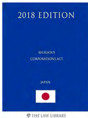
Front page of 2018 English version of Religious Corporations Act of Japan .