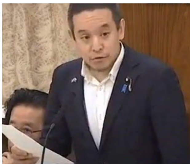
Satoshi Hamada asking questions in the Japanese Parliament 13th May 2024

Satoshi Hamada (浜田 聡), member of the House of Councillors, the Upper House in the National Diet of Japan since 2019, asked on 13th May 2024, several questions to the parliamentary Administrative Oversight Committee concerning the current case at Tokyo District Court about the Kishida administration's request for a court order to dissolve the Family Federation of Japan.