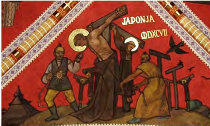
From Japan's history of religious persecution. Here, scene from a painting depicting the 26 martyrs of Japan, a group of Catholics martyred by crucifixion in Nagasaki 5th February 1597.