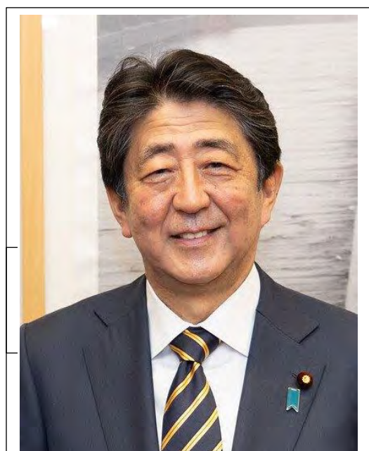
Assassinated on 8th July 2022. Here, former Japanese Prime Minister Shinzo Abe some months earlier, in March 2022

Ever since the assassination of former Japanese Prime Minister Shinzo Abe by Tetsuya Yamagami (山上 徹也) in July 2022, media outlets have attempted to sit down with Yamagami's mother for an interview. The first known instance of details about his mother being presented by the media, was two weeks after the murder, when she and Yamagami's younger sister were seen taking a taxi to an estate in the mountains owned by one of Yamagami's uncles, presumably to avoid being hounded by the media.