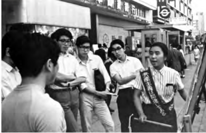
From a Victory over Communism campaign in Japan in 1969, supported by the Unification Church .

The 12 NGOs point out that after the terror attack on Abe, a network of lawyers and others "hostile to the Family Federation " used the murder of Abe as a pretext to revive an old campaign started by left-wingers mainly for political reasons. For decades, they had been afraid of the Family Federation's "successful sponsorship of anti-Communist initiatives".