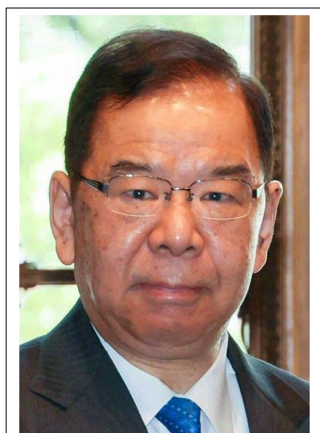
In Nov. 2022 interview, Kazuo Shii, chairman of the Japanese Communist Party (JCP) said the party is fighting the " final war " against the Family Federation / Unification Church . Here Shii on 30th March 2023