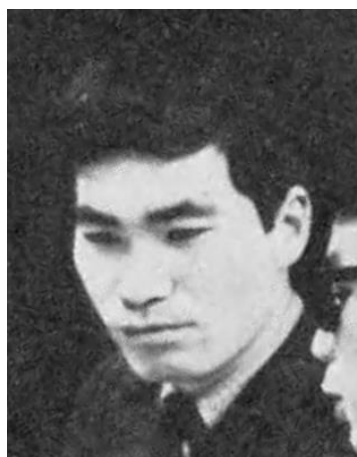
Masao Adachi (1939-), film producer, scriptwriter, actor and member of Japanese Red Army

said before the assassination that he was starting a revolution. And he has been praised openly by many communists after his act of terror.