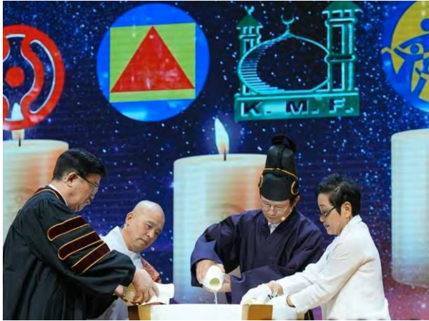
Religious leaders performing a ceremony for unity 6th June 2024