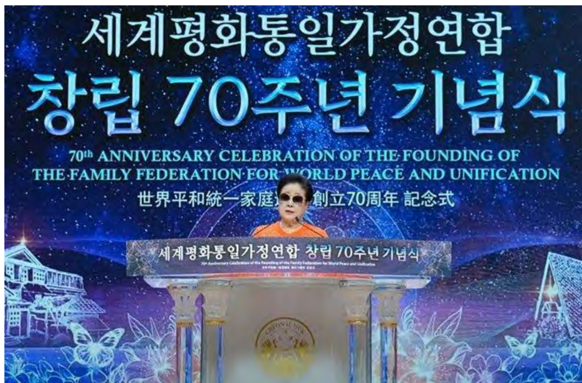
Mother Moon speaking on 6th June 2024 in Gapyeong, South Korea

She encouraged all members to fulfill their responsibilities and contribute to the great task of realizing a unified Korea and a unified world.