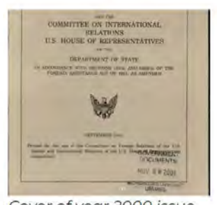
Cover of year 2000 issue of Country Reports on Human Rights Practices. Public domain image

On the one hand, the U.S. State Department has addressed the issue of abduction and confinement of Unification Church believers in its International Religious Freedom Report and Country Reports on Human Rights Practices since 1999.