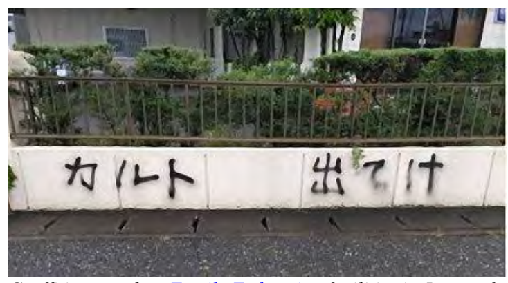
Graffiti sprayed on Family Federation facilities in Japan after the Abe assassination in July 2022

The <u>Family Federation</u> announced that it will present these details in writing to Tokyo District Court during the hearings for the dissolution order requested by the Kishida administration. The religious organization also reported recurring incidents of graffiti with messages like "Traitor cult" and "Cult, get out," along with nuisance phone calls at churches in various locations across the nation.