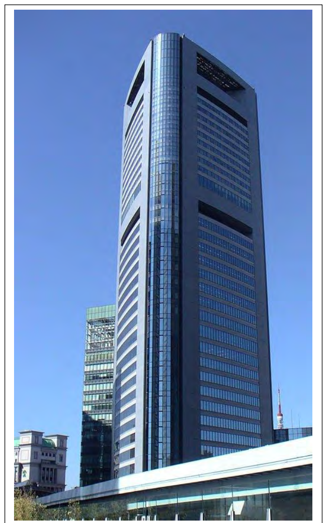
Shidome Media Tower, located in Shiodome, Minato, Tokyo, Japan. Floors 1 - 24 are the headquarters of Kyodo News, Japan's largest news agency

Large Japanese news agency reports on hundreds of rights violations suffered by minority faith