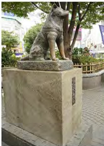
Hachiko, the Loyal Dog (忠犬八子公) at Shibuya station in Tokyo.

Ultimately, we must hold these demonstrations in Tokyo. (Applause) Thank you. I have been talking about this with the headquarters, but it seems they are not very enthusiastic about it at the moment. However, at this point, doing nothing is not an option. It's not like you do nothing; you hold symposiums nationwide. But you still have to make your case to the general public.