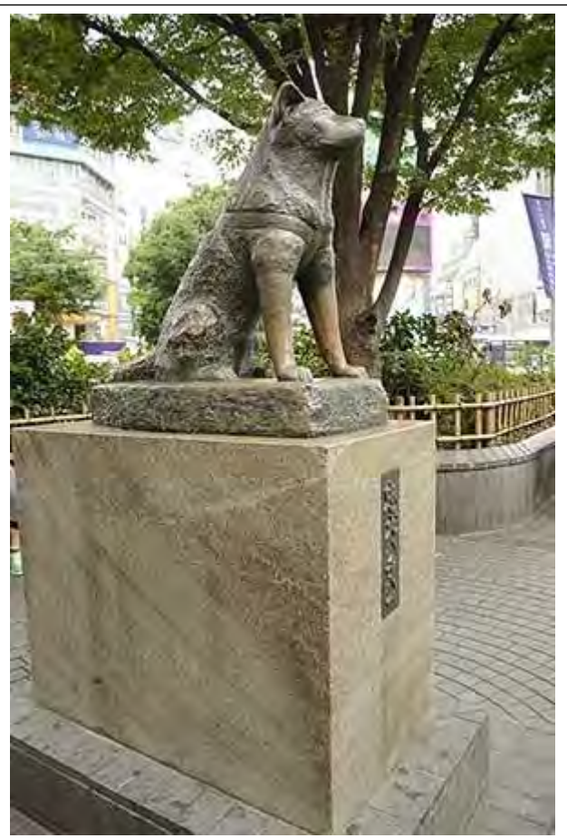
Hachiko, the Loyal Dog at Shibuya station, Tokyo

Previously, at gatherings in Nagasaki and other places, I have mentioned that demonstrations are a citizen's right. Given the current situation with the Family Federation, I believe we should raise our voices in a noticeable way.