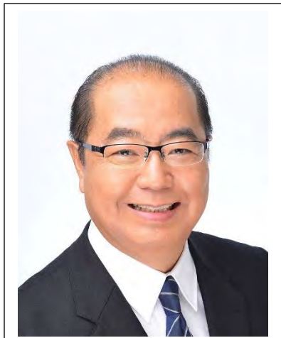
Hachiro Nitta, governor of Toyama prefecture since 2020

Hirohisa Fujii (藤井裕久), who was first elected mayor of Toyama City in 2021, served four terms as a prefectural assembly member with the endorsement of the Liberal Democratic Party (LDP). When he ran for mayor as an independent, he received recommendations from the LDP, the Constitutional Democratic Party (CDP), and the Democratic Party for the People (DPP). During the election, he visited the facilities of the religious organization and received support from it and related associations.