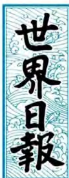
Logo of the Sekai Nippo

by the Religious Freedom Investigative Team of the