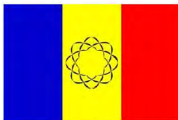
The Soka Gakkai International flag.

with socially problematic organisations, those taking a stance against the Liberal Democrats can continue to point out the social problems of other religious organisations, such as the Soka Gakkai [創価学会 – the new Buddhist movement on which the political party Komeito is based, the governing Liberal Democratic Party's coalition partner]. They can say, "Why do you declare you have cut ties with the former Unification Church (Family Federation for World Peace and Unification), but not with other religious groups?" It would not be a situation where they could form a coalition. It can be said that Prime Minister Kishida without thinking has destroyed the identity of the Liberal Democratic Party.