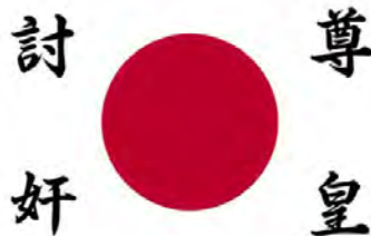
From Japanese history: Flag used by the Righteous Army during the February 26, 1936 coup attempt. The four characters reading "Revere the Emperor, Destroy the Traitors" (尊皇討奸) are placed in the corners of a standard Japanese flag. Photo: Cckerberos / Wikimedia Commons. Public domain image

– In your book, the situation of the believers surrounded on all sides (四面楚歌), is described as "today's non-citizens" (令和の非国民).