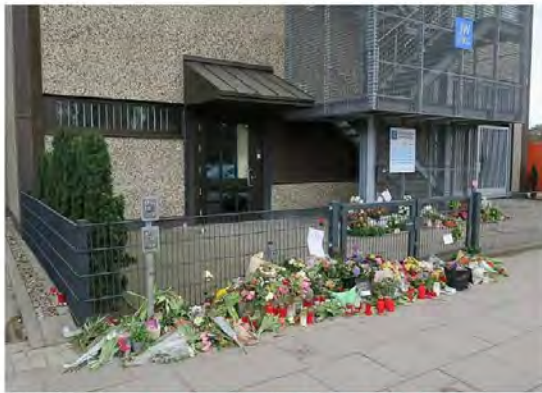
Did constant fear-mongering from faith-breakers cause terror attack against the Jehovah's Witnesses in Hamburg? Here, the Kingdom Hall in Hamburg-Alsterdorf, ten days after the killing spree on 9th March 2023: damaged door, flowers and candles.

Basically, this came to an end in the USA when some